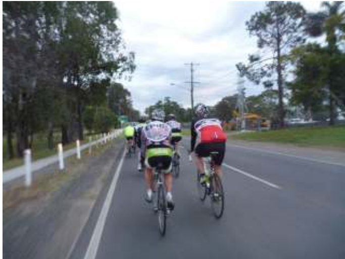
Group starting out.