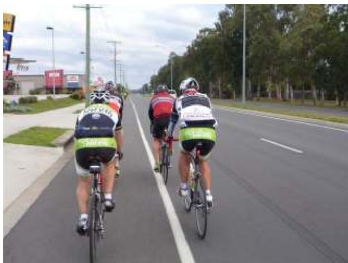
Flatland boys leading out