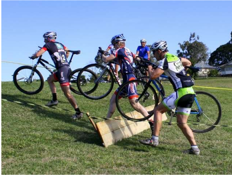
Jump mate !!